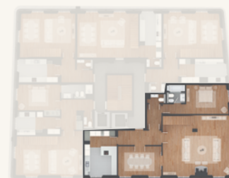
Planta Piso 3 / 3rd Floor Plant