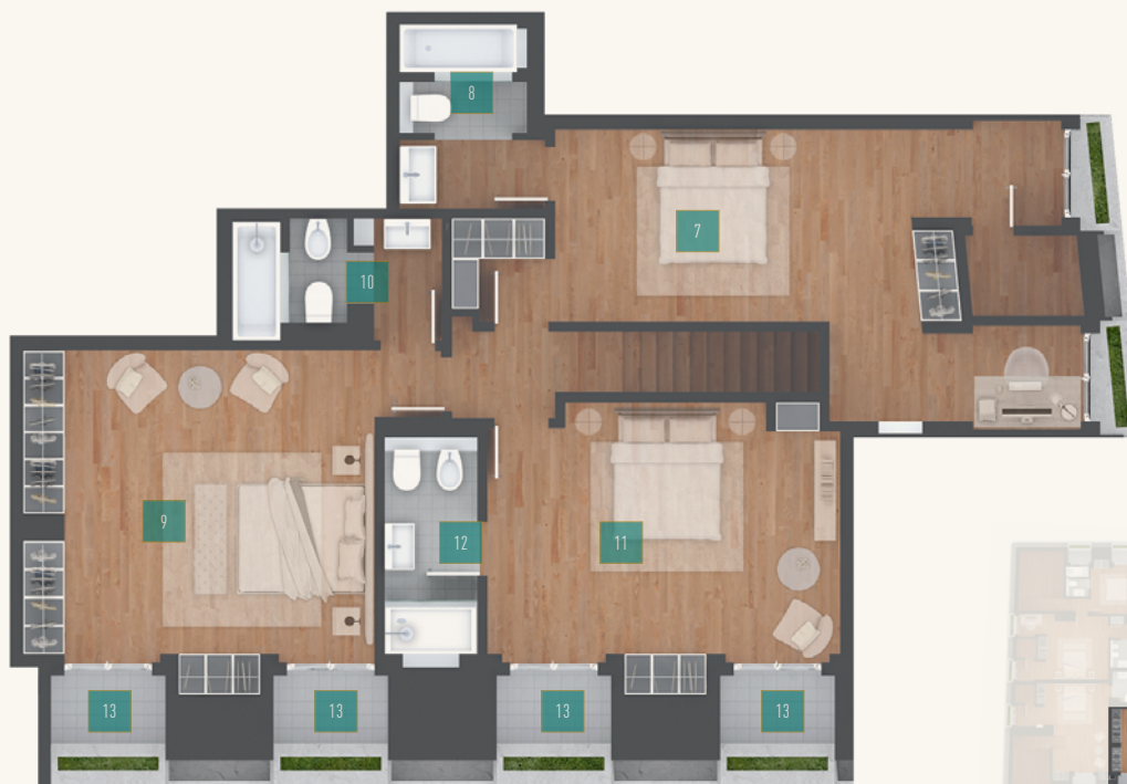
Planta Piso 4 / 4th Floor Plant